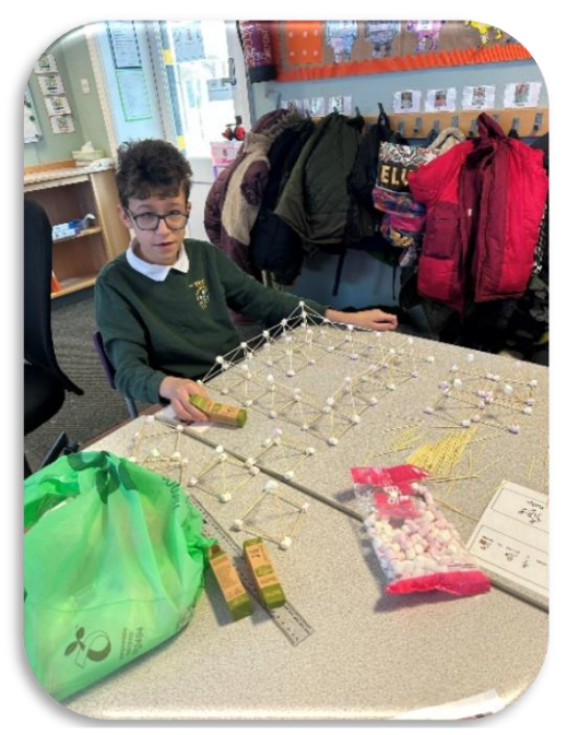
Marshmallows and cocktail sticks

Mr Western's class have been looking at the Ancient Egyptians this half term. They have been creating different pyramids this week using different materials.